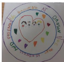
Year 1 - RILEY