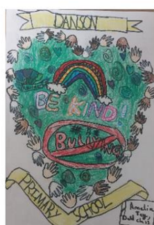
Year 4 – AMELIA