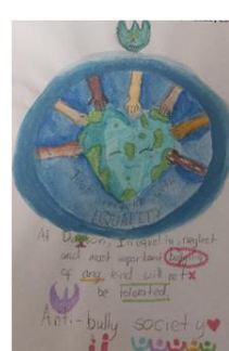
Year 6 - EMILIA