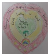
Year 2 - VEDANSHI