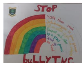
Year 3 - IVETA